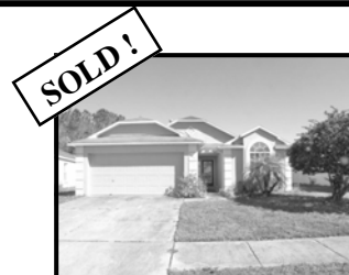
SOLD! SOLD July 29 Short Sale 8511 Bella Way 8511Bella.com

Search the Multiple Listing Service (MLS) like an agent! It's Free and you can search 24/7 to see homes for sale and get the latest daily updates. Go to: www.SearchAllHomes.ListingBook.com