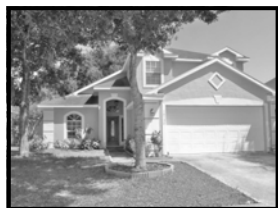
FOR SALE 3BR + Loft! Woods in rear! 10120 Charleston Corner Rd 10120Charleston.com