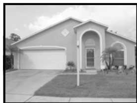
SALE PENDING Huge Game Room! 8803 Sea Island Way 8803SeaIsland.com