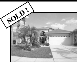
SOLD! SOLD July 22 Pool! Pond! 8510 Heyward Road 8510Heyward.com