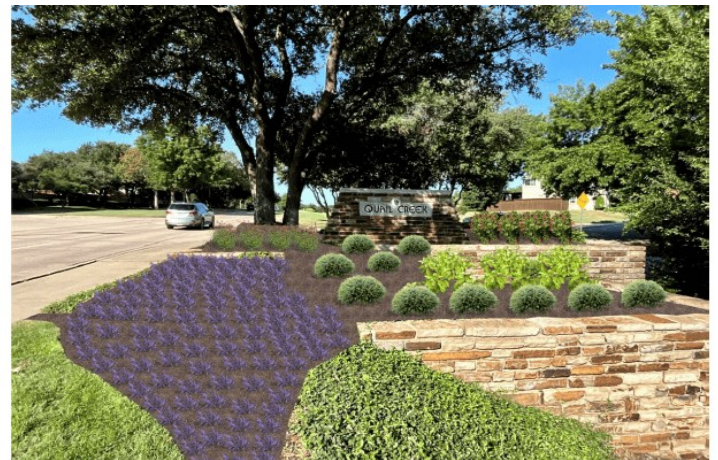
Quail Creek – Before and After Renderings