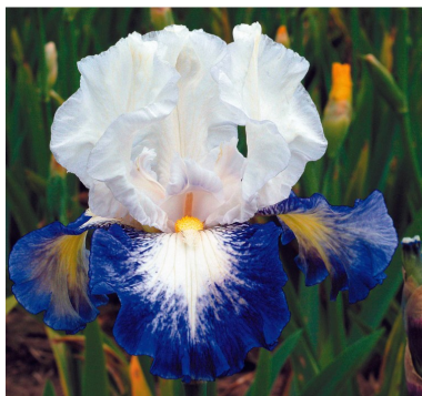
Can't Touch This

Irises have a history of thriving in Texas. The irises around these abandoned farmhouses continue flourishing long after the people who planted them are gone. These stately plants keep flowering with very little care. Irises grow and spread using rhizomes both above and below the ground. Once established, they are highly drought-tolerant and can be relied upon to bloom every spring, providing dazzling flowers. Many will flower again in late summer, though with fewer blooms.