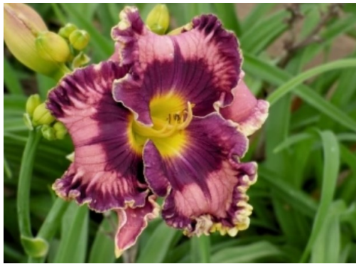
Born In California